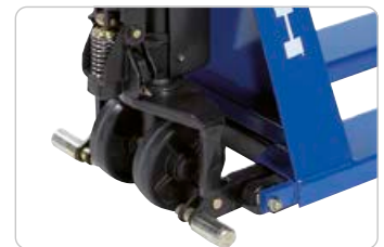
Fitted with stabilisers